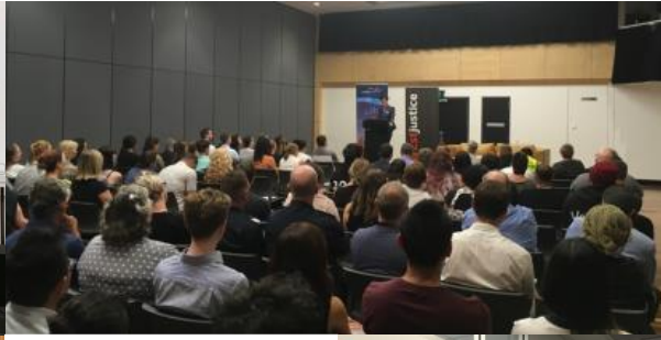
Couch Surfing Limbo report launched by the Commissioner for Children and Young People, Liana Buchanan and hosted by Wyndham City Council