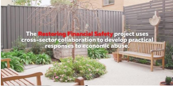
The Restoring Financial Safety project uses cross-sector collaboration to develop practical responses to economic abuse.