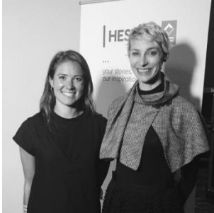
WEstjustice's Employment Law Project wins HESTA Community Sector Award for Outstanding Organisation