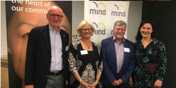
Health justice partnership Justice in Mind launch with Mind Australia