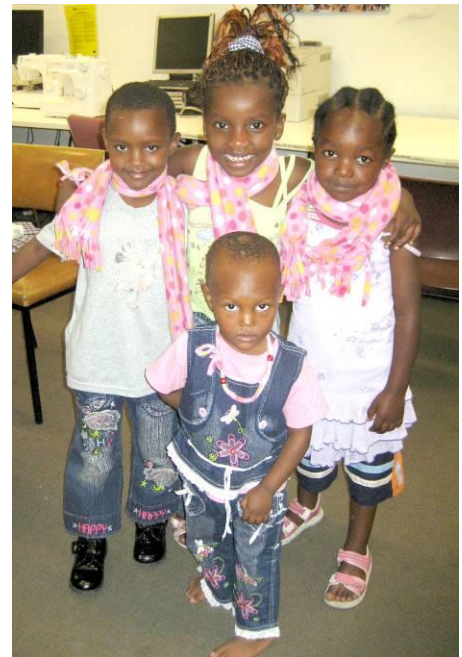
Photo: Burundi children wearing fleecy scarves.

At the beginning on 2010 a group of Burmese/Chin women classes initially from 4 p.m. until 6 p.m. They were also t teacher.