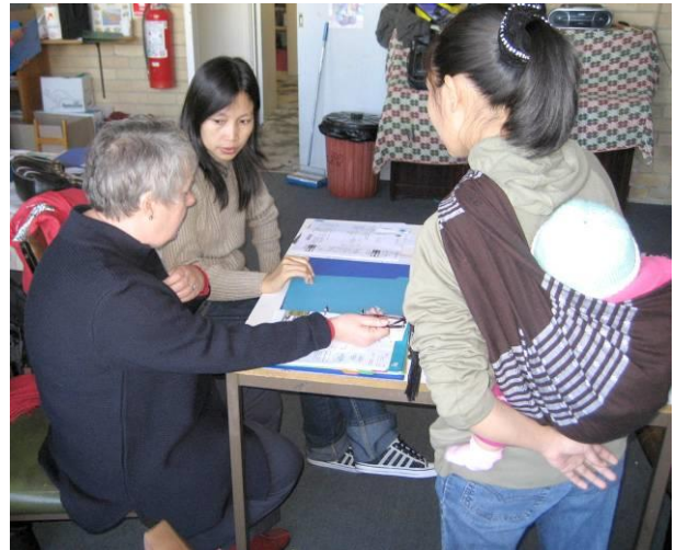
Photo: Footscray Community Centre’s Financial Counselling Service at “Bring your Bills” day.

Brotherhood Green also attended on these days and provided an information session on energy saving. They also offered the women their retrofit facility where a representative from Brotherhood Green would come directly to people’s homes and provide energy saving products such as energy saving light globes, shower heads and other energy saving ideas. Fifteen retrofits were organised. The women since have all noticed a decrease in their energy accounts and now have a better understanding of energy usage in their homes.