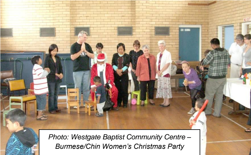
Photo: Westgate Baptist Community Centre – Burmese/Chin Women’s Christmas Party

The Footscray Community Legal Centre also participated in their Christmas breakup and the women were given sample bags containing a range of information translated into Burmese, gardening gloves and seeds to encourage them to grow their own herbs and vegetables.