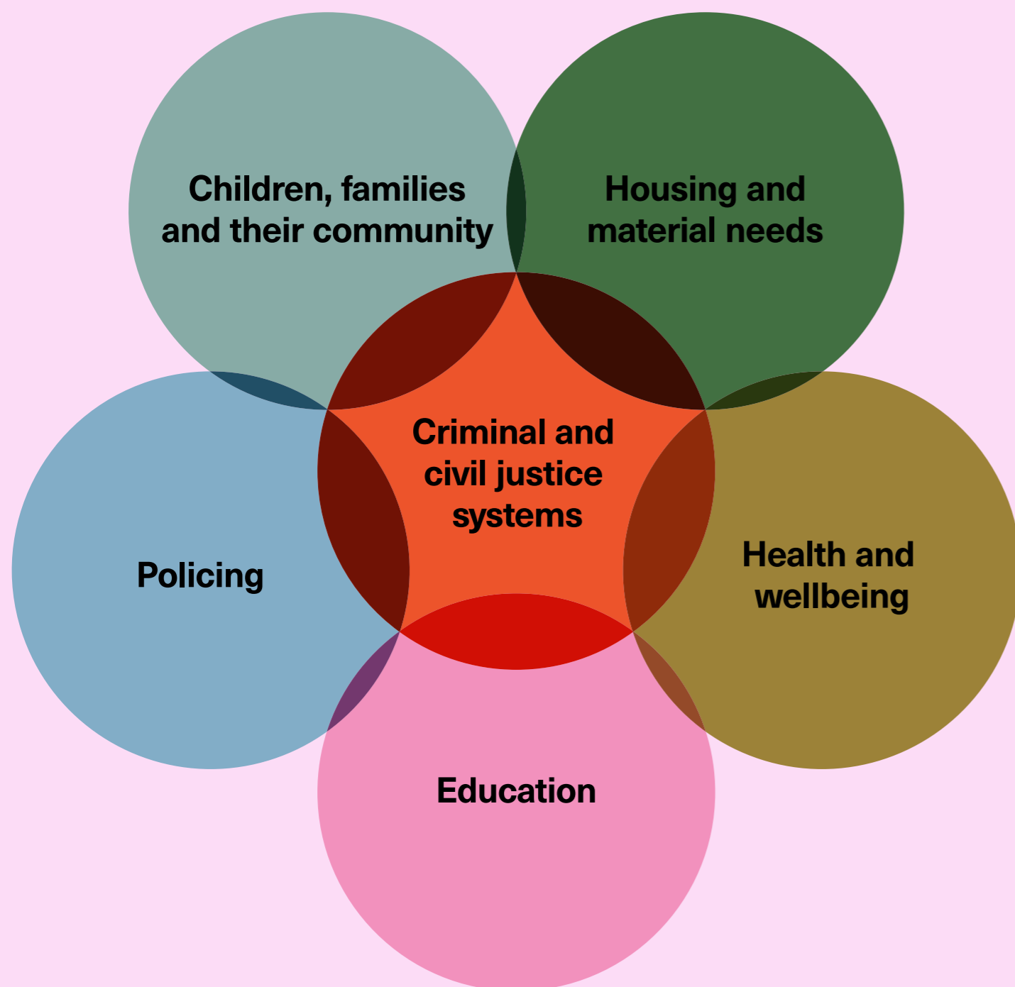
Figure 1: Whole of government and six portfolio areas of focus in SJ4YP's Action Plan.

The over-representation of these five groups of young people in the criminal justice system is an urgent problem that requires our immediate attention . Our Action Plan is the most effective way to enable deep cross-sectoral collaboration; tackle shared systemic drivers; and redirect our efforts and finite resources to prevention and addressing under-representation.