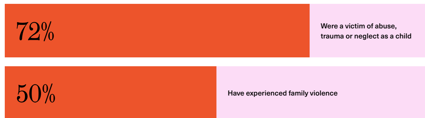
Table 2: Characteristics of young people in youth justice custody 162

Victoria’s mainstream early childhood and primary and secondary education systems along with our out-of-home care and youth justice systems are not equipped and currently fail to identify, understand and appropriately respond to the impact of trauma on First Nations children and young people, as well as multicultural youth from refugee backgrounds. As the Royal Commission into Victoria’s Mental Health System points out, ‘the mental health system does not currently deliver safe, responsive or inclusive care for many people from diverse communities and social groups’. 140 In the present system, trauma goes unseen, and the system itself can cause trauma. 141 The Royal Commission further notes the interface between the criminal justice system and mental health system lacks coordination. 142 These failures impact disproportionately on young people from First Nations, African and Pasifika backgrounds as well as care-experienced young people and young women who have experienced trauma.